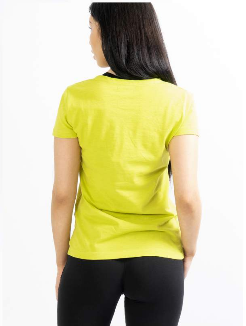
ZOYA GYM PANT