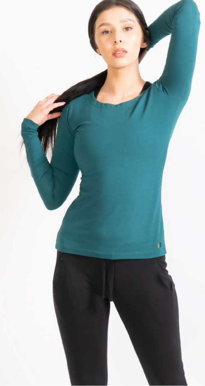
FEBE LONG SLEEVE T 100% ORGANIC COTTON