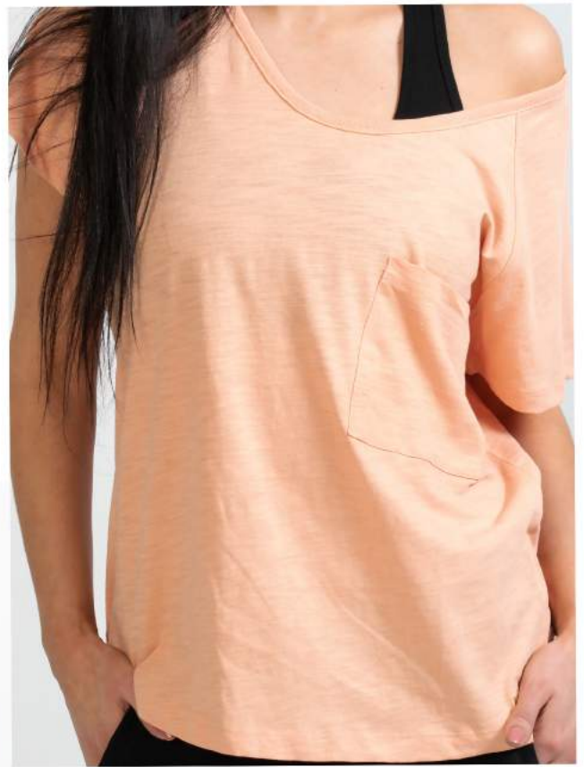
EFFIE SLOUCH POCKET T