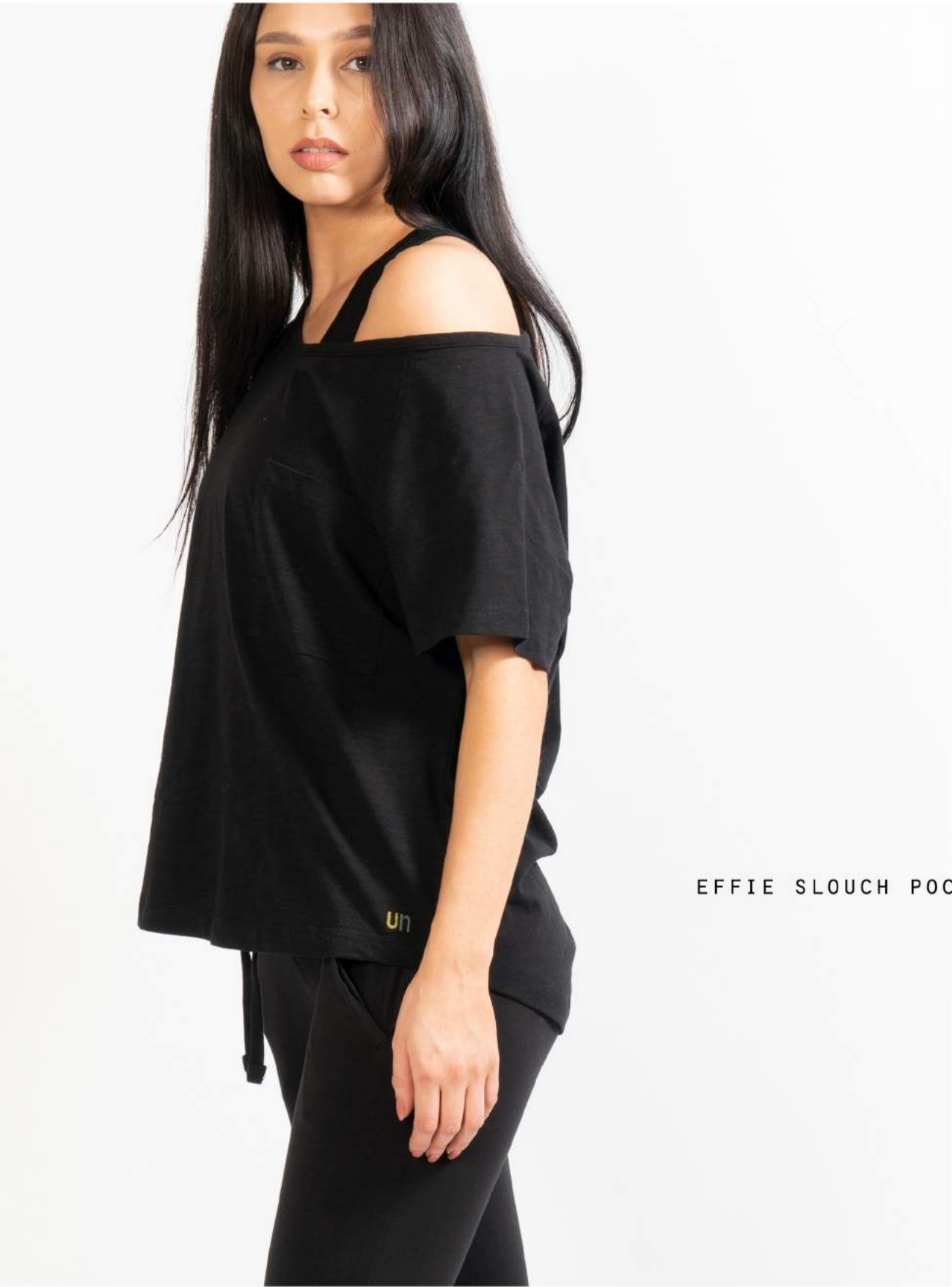
EFFIE SLOUCH POCKET T