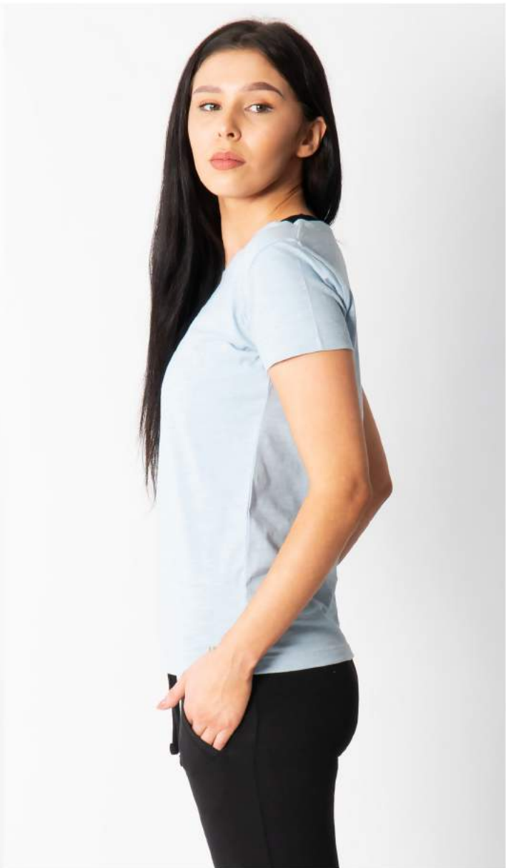
ALECTA SLUB T IN POWDER BLUE