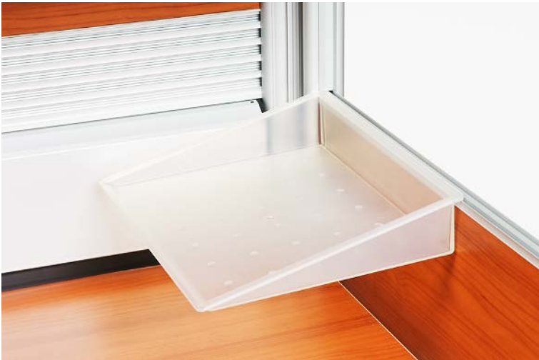
Comes With 2 Paper Tray's

All Cube in-a-Box Products come standard with these listed accessories. If you need more accessories, please contact your local Cube in-a-Box rep.