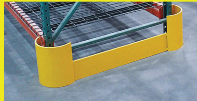
Double Side Rack Protector