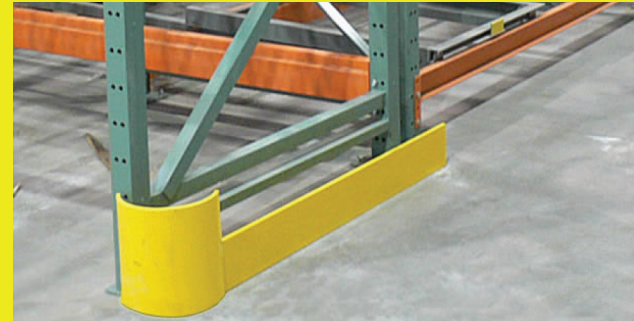
Single Side Rack Protector

Also available in Medium Duty (5/16 in thick) and Light Duty (1/4 in)