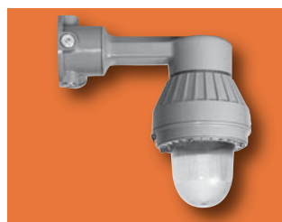
EFEPW= Wall bracket mount 14 lbs.