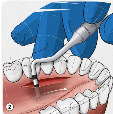
② Preparation to gain connective tissue, using the instrument