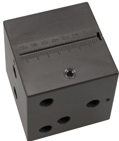
Ruler 37 mm, calibrated

Step 4: Coat each Master Cone with sealer and return each respective Gutta Percha Cone back into each respective canal.