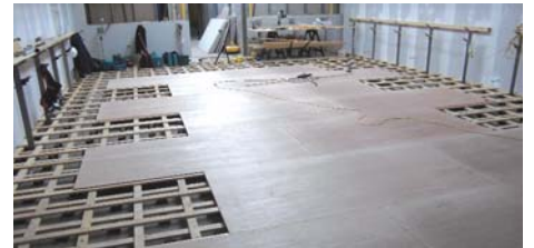
Basket weave at the Scottish Ballet

“ It is as dangerous to dance on a hard floor as it is to constantly dance on different types of floor. The best preventative method will always be the installation of a correct dance floor. ”