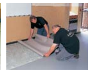
Harlequin vinyl performance surface

A White Paper – The Facts about Sprung Floors for Dance – can be downloaded at www.harlequinfloors.com