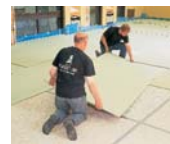
First layer of semi-flexible panels