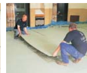
Top semi-flexible panel layer with joints staggered