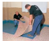
Cellular polyurethane layer