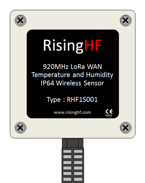
Figure 1 Outside view of RHF1S001