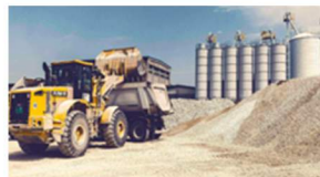
Run Hours Monitoring