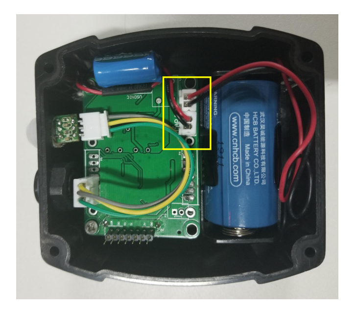
Figure 5.1 Connect battery and capacitor