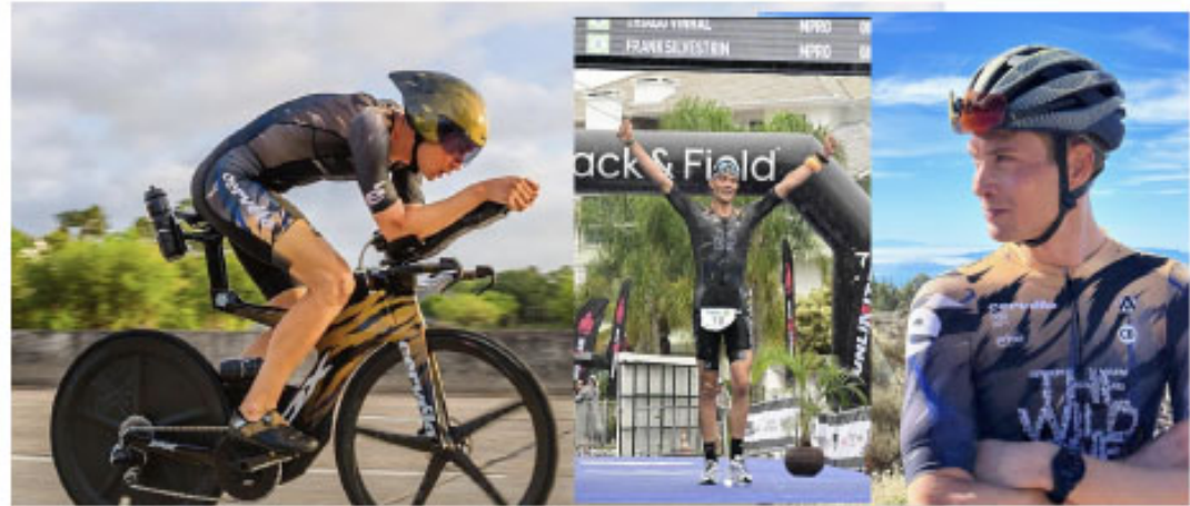
Michiel de Dilde - Pro Triathlete