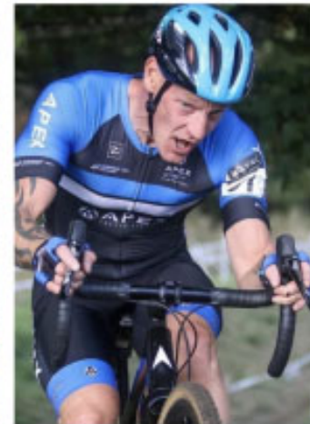
Geared up - Apex Racing Team