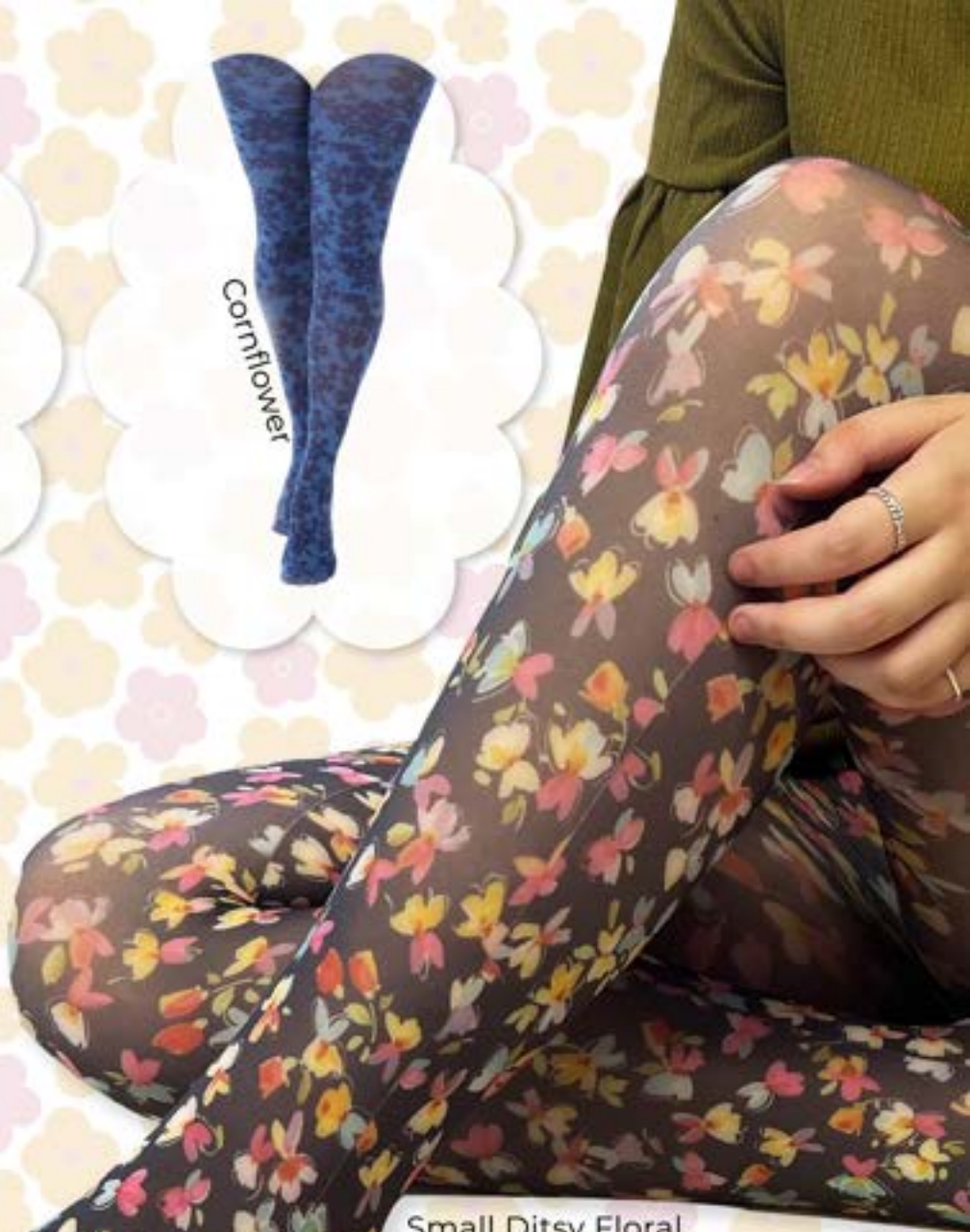
Small Ditsy Floral