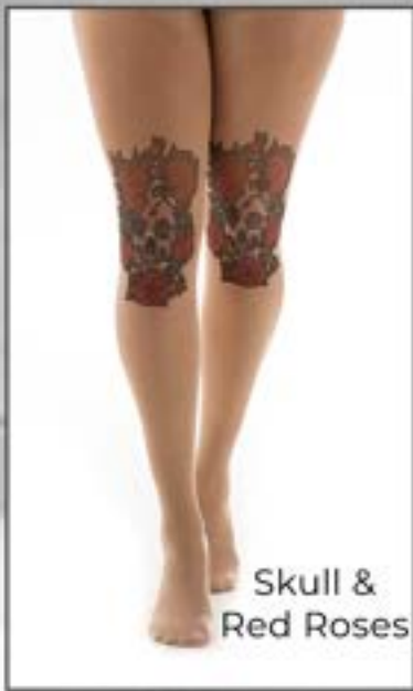
Skull & Red Roses