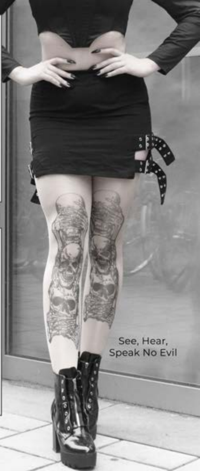
See, Hear, Speak No Evil