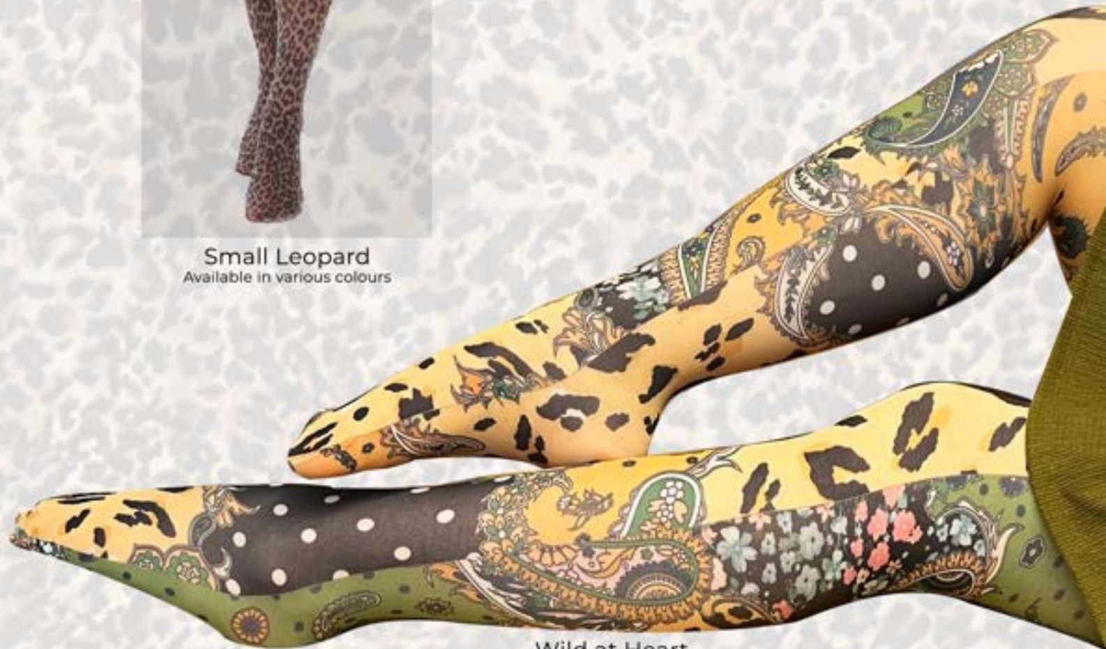
Wild at Heart