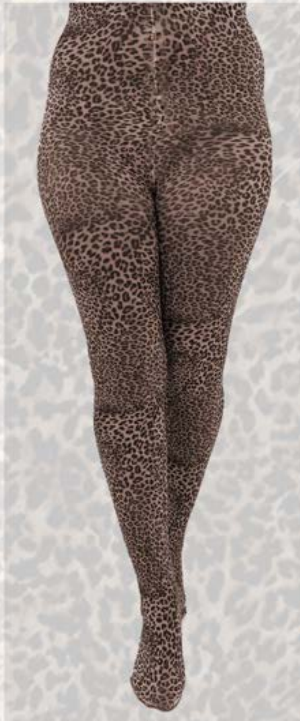
Petite Leopard Available in various colours

Animal print is a timeless fashion staple. Our animal printed tights are popular with lots of different customers. The Small Leopard in Natural remains a bestseller year after year. However, as trends evolve, so do our animal prints. We introduce new designs regularly so be sure to sign up to our mailing list to receive the latest news and launches.