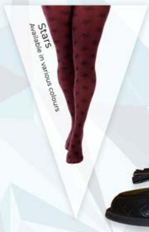
Stars Available in various colours