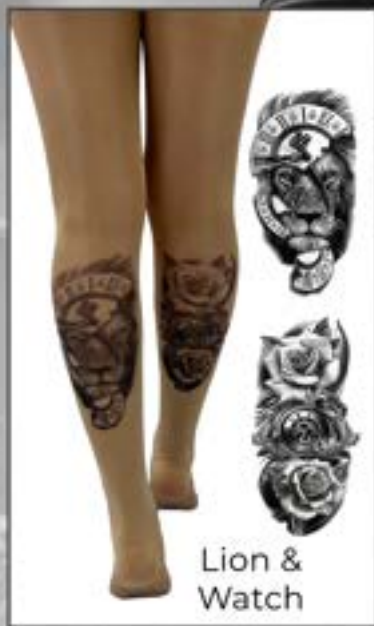
Lion & Watch