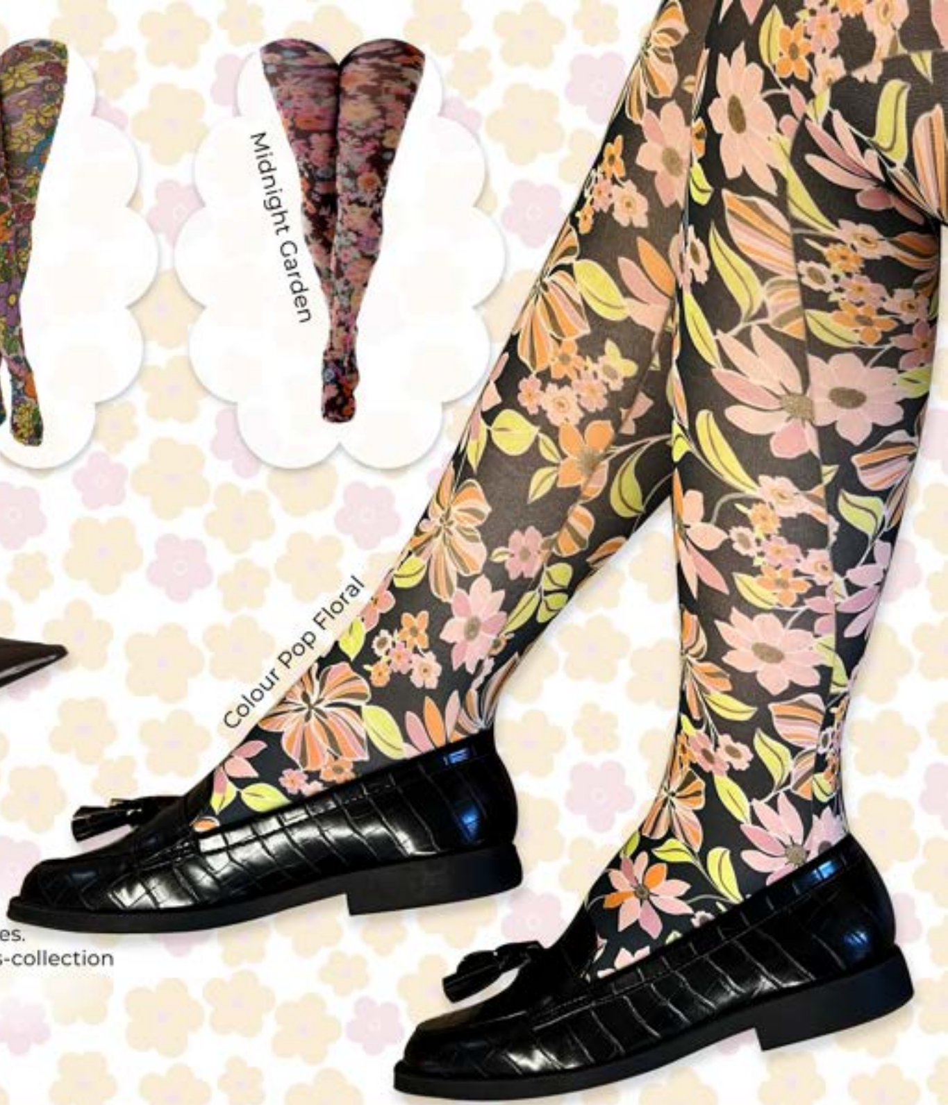
Colour Pop Floral

We regularly introduce new designs, don't forget to check our website for the latest styles. pamelamann.co.uk/collections/printed-tights-collection