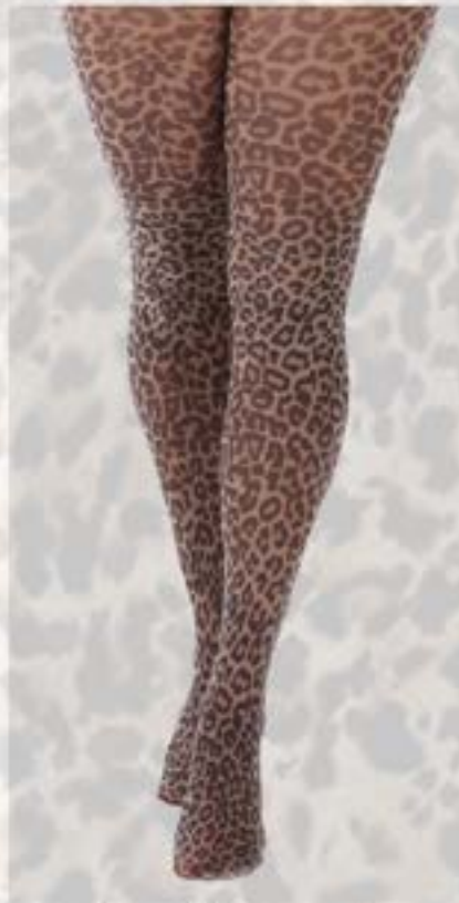
Small Leopard Available in various colours