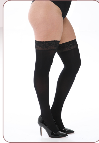
50 Denier Lace Top Hold Ups Black One Size, 16-18, 20-24 EU 36-42, 44-46, 48-52