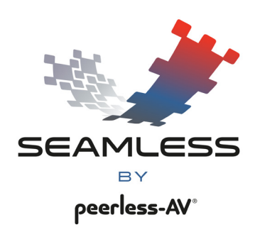
Also available as: