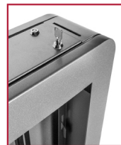
Keyed-Alike Cam Locks