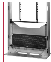
Component Tray & Shelf Custom Colours Available