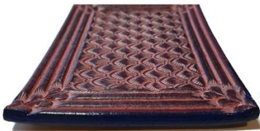
Ocean Blue Edge Ink