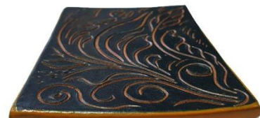
Orange Edge Ink