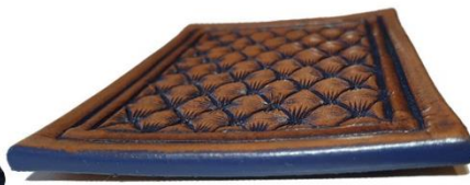
Purple Edge Ink