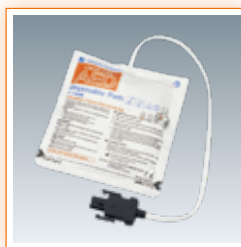
• Defibrillation Pads (P-740K)

This brochure may be revised or replaced by Nihon Kohden at any time without notice.