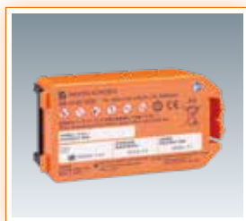
• Battery Pack (SB-310V)