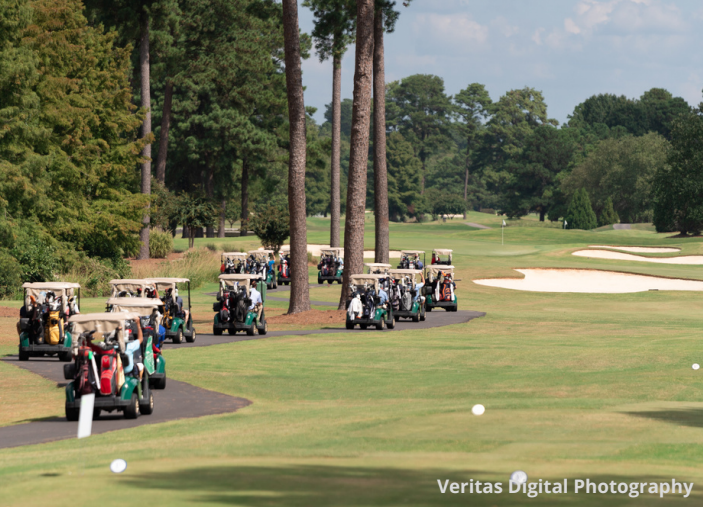
Veritas Digital Photography