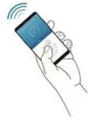
Bluetooth APP Control