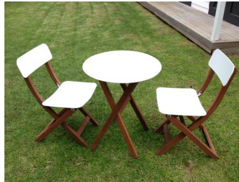
Signing Table: FOC