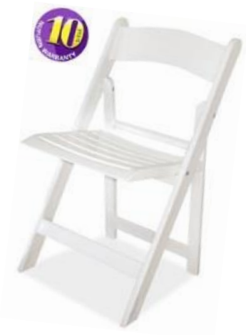
'Wimbledon' chair: $8 each