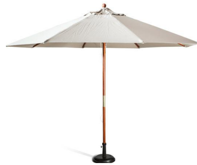
Umbrella: $25 each