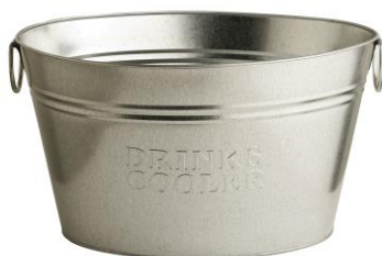
Drinks Tub 51.5L 38W x 28.5H: $5.00 each