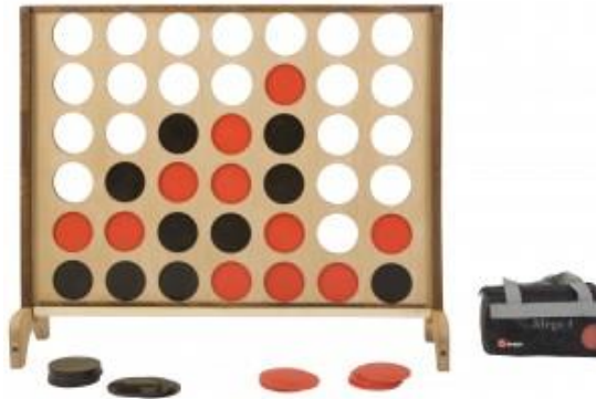
Mega Connect Four: $50.00