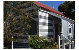
1. Torquay Q/B, 3 x S/B & Spa