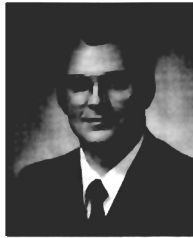
Gary C. Hunt

The theory proposed by Root et al for the evaluation and treatment of foot and ankle disorders has gained increased