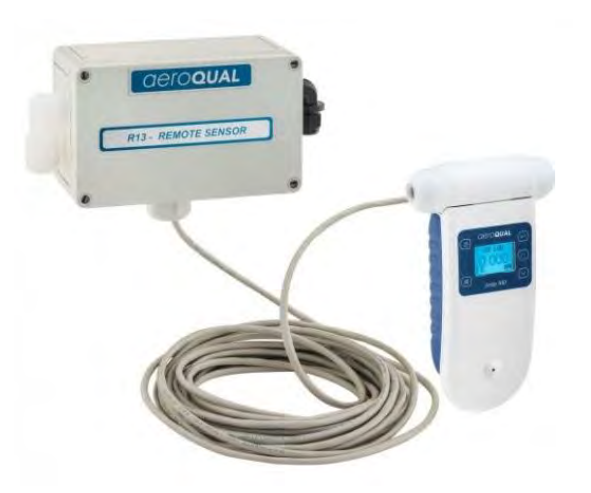
Note 2: The IP41 rated enclosure is only compatible with the Type 2 sensor heads.

The monitor base can now be turned on and measurements taken.