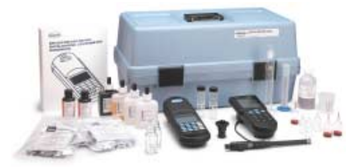
CEL/850 Basic Drinking Water Laboratory