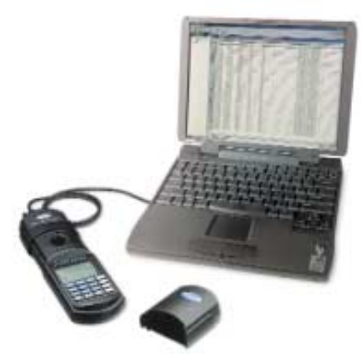
Data Transfer Adapter converts infrared signals from the instrument to standard RS-232 protocol. The adapter fits over the instrument in place of the cap and connects directly to a printer or computer.

Lit. No. 1983 Rev 1 G9 Printed in U.S.A. ©Hach Company, 2009. All rights reserved.