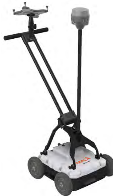
The tablet is attached to the tablet holder on the top part of the handle. The GNSS device or Total Stations prisms (on top of an extension pole) is attached to the GNSS bracket with a quick release mechanism.

The rear left wheel has an internal encoder for data triggering and precise distance measurements.