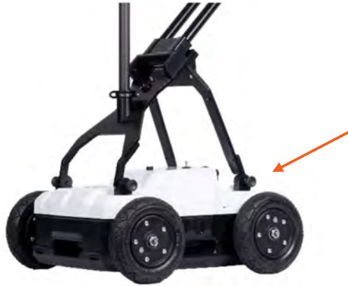
Release the four bolts by pulling and rotating a quarter turn.

The handle can be folded for transportation but also completely detached from the Easy Locator Core antenna. The handle is attached with four quick release bolts. Release these and the handle can be removed.