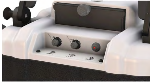
The batteries are found under the black lid. It is possible to hot-swap, one battery at time, during measurements.

Note: When powering OFF; press and hold the ON/OFF button.