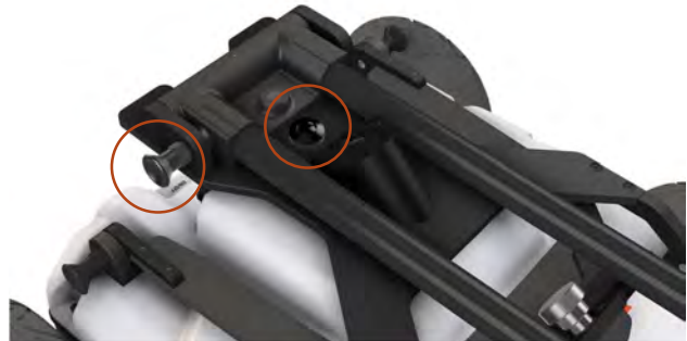
Press the button and pull the quick lock knob to unfold the handle. Secure the silver-coloured knob when in upright position.

Fit the two handle parts to each other and, when in upright position, secure the silver-colored knob on the mid part.