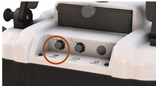
Connector for external encoder found to the left.

The Easy Locator Core can be used with an external encoder wheel as well, as together with a RTC Mini. The external encoder is connected on the back side of the Easy Locator Core. If an external wheel is connected, the EL Core GPR system will automatically detect this.