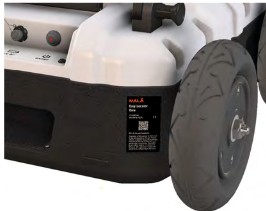
Label with information on serial number and QR code.

For further instructions see; MALÅ Controller App User Manual or MALÅ Controller App Quick Guide .