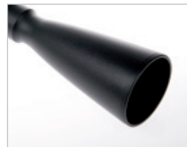
Long range module