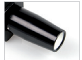
Close focus module