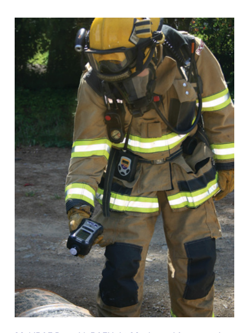
MultiRAE Pro with RAELink3 Mesh used for screening potentially hazardous drums