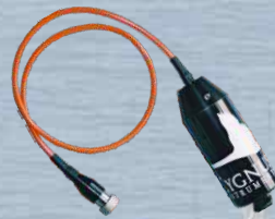
Mini ROV Mountable