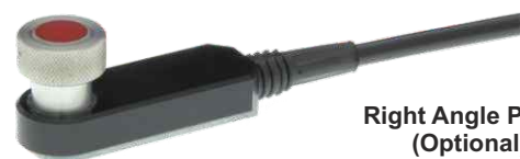
Right Angle Probe (Optional)

With multiple echo, readings are taken by measuring the time delay between any three consecutive backwall echos. The time of T1 (coating thickness) is ignored. The times of T2 and T3 are equal to the time that it takes to travel through the metal. Only by looking at three echos can the measurements be automatically verified (where T2 = T3).