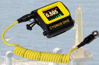
DIVE (Underwater A-Scan)