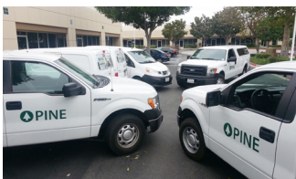
Local Delivery Pick-up