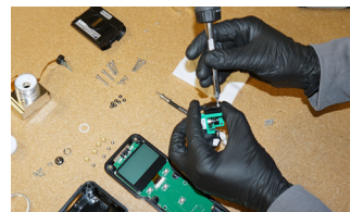
Repair &amp; Calibration