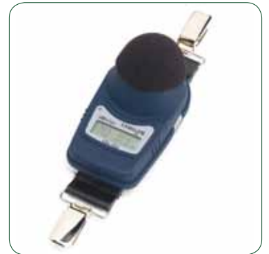
CEL-350 with CEL-6352 Crocodile Clip Kit