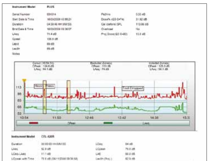
An example of a run report