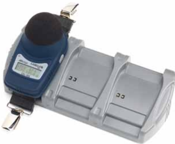
The CEL-6362 3-way charger with 1 dB Badge