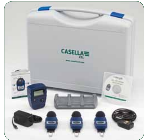
A typical measurement kit

For software to go with the d Badge kits, please refer to Casella Insight data sheet.