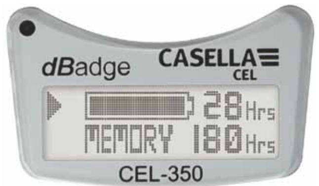
'Fuel gauge' display for memory and battery information

'Pro' mode, available on CEL-350 and CEL-352 models, allows additional exposure values to be displayed. For EU regulations LEX,8h and Projected LEX,8h are displayed; for US regulations TWA, Projected TWA and percentage dose values are displayed. The screen can of course be locked so the operator cannot see any noise parameters, removing the temptation to tamper with results!