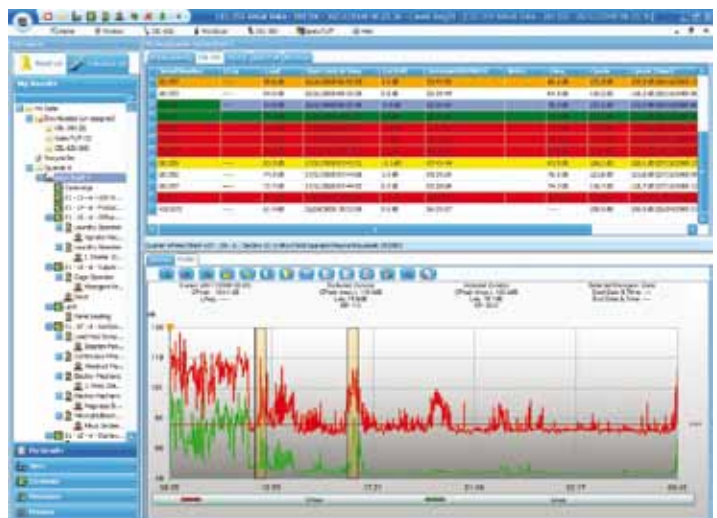
Tree style database of results with colour coding for exceeded noise action levels