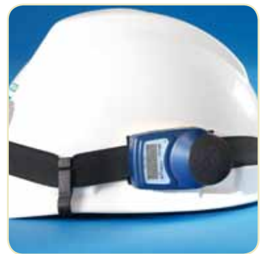
CEL-350 mounted on a hard hat using CEL-6354