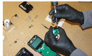
Repair &amp; Calibration