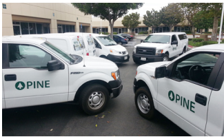
Local Delivery Pick-up