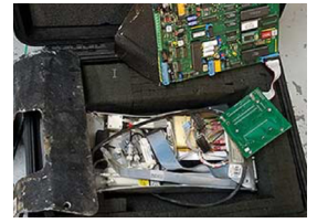
Rental Protection Plan