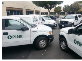
Local Delivery Pick-up