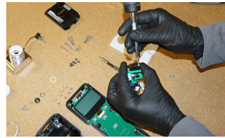
Repair & Calibration