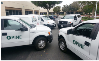
Local Delivery Pick-up