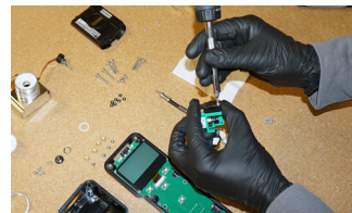
Repair &amp; Calibration