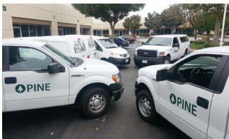
Local Delivery Pick-up