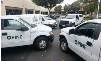
Local Delivery Pick-up