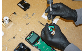
Repair & Calibration