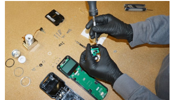
Repair & Calibration