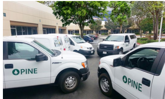
Local Delivery & Pick-up