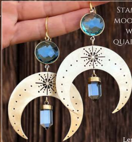
STAMPED BRASS MOON EARRINGS W/ AQUA & QUARTZ CRYSTAL POINT

E225 Length: 3 1/8" Weight: 11.8g each Wholesale: $77 MSRP: $154