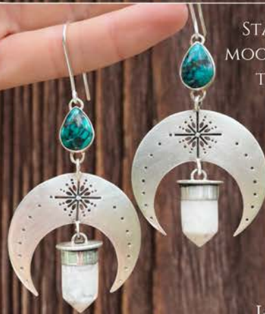
STAMPED SILVER MOON EARRINGS W/ TURQUOISE & HOWLITE

E209 Length: 3 3/8" Weight: 11.8g each Wholesale: $140 MSRP: $280