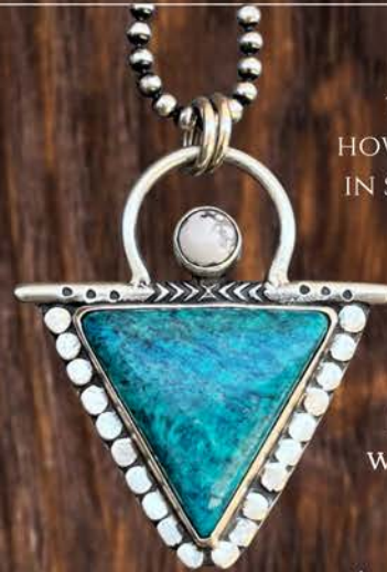
TRIANGLE TURQUOISE & HOWLITE NECKLACE IN STERLING & FINE SILVER