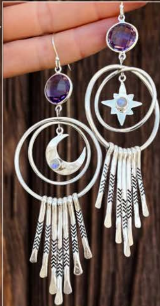
CELESTIAL FRINGE HOOPS WITH AMETHYST & MOONSTONE IN STERLING & FINE SILVER