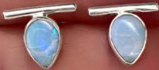
OPAL BAR STUDS IN STERLING & FINE SILVER