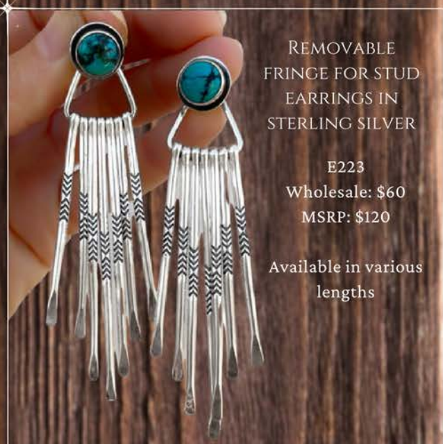
REMOVABLE FRINGE FOR STUD EARRINGS IN STERLING SILVER