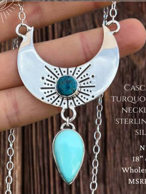
CASCADING TURQUOISE MOON NECKLACE IN STERLING & FINE SILVER