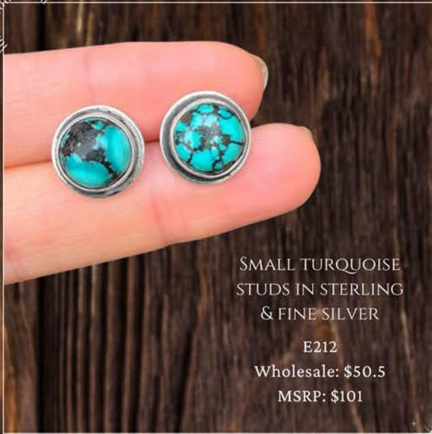
SMALL TURQUOISE STUDS IN STERLING & FINE SILVER