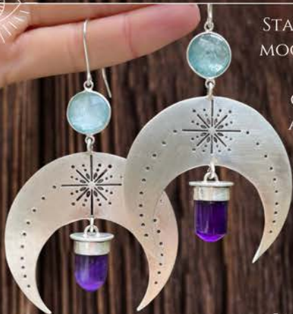
STAMPED SILVER MOON EARRINGS W/ AQUA QUARTZ & AMETHYST

E208 Length: 2 5/8" Weight: 8g each Wholesale: $95 MSRP: $190