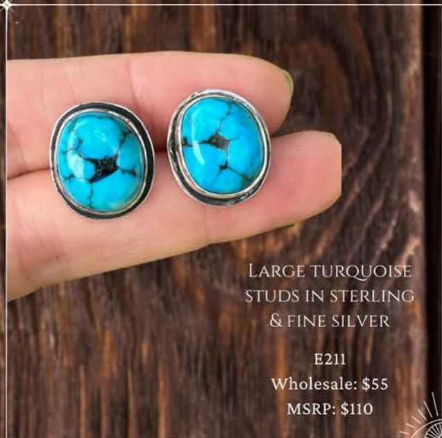
LARGE TURQUOISE STUDS IN STERLING & FINE SILVER