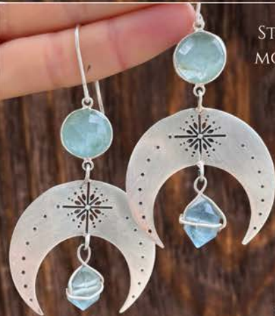
STAMPED SILVER MOON EARRINGS W/ AQUA QUARTZ & FLUORITE

E225 Length: 3 1/8" Weight: 11.8g each Wholesale: $77 MSRP: $154