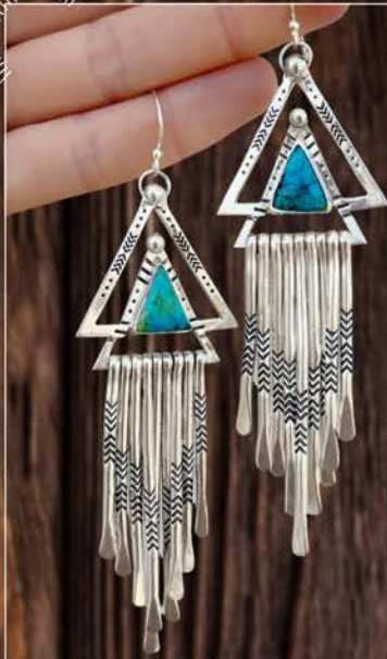
TURQUOISE TRIANGLE FRINGE EARRINGS IN STERLING & FINE SILVER