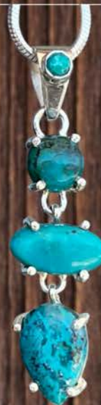
CASCADING TURQUOISE NECKLACE IN STERLING & FINE SILVER