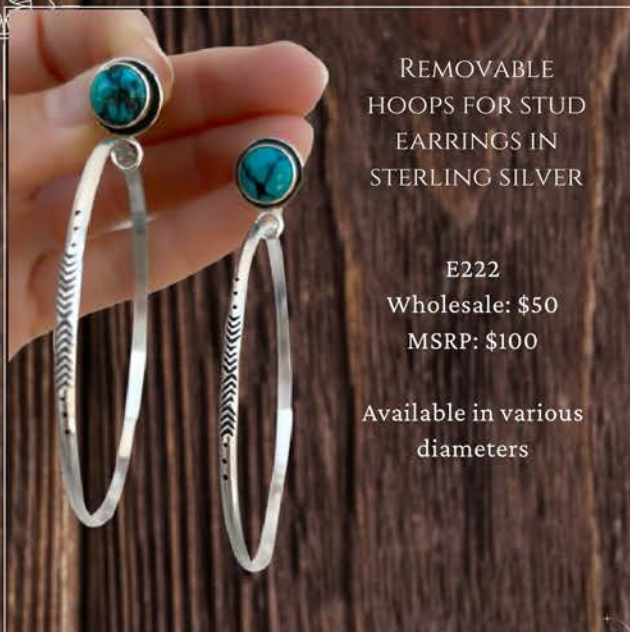
REMOVABLE HOOPS FOR STUD EARRINGS IN STERLING SILVER