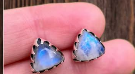
MOONSTONE TRIANGLE STUDS IN STERLING & FINE SILVER