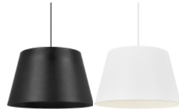
Textured Black / Black