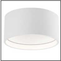
WH - White