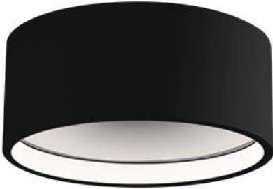
BK - Black