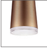
VB - Vintage Brass