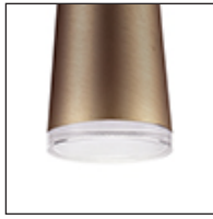
VB - Vintage Brass