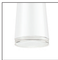
WH - White