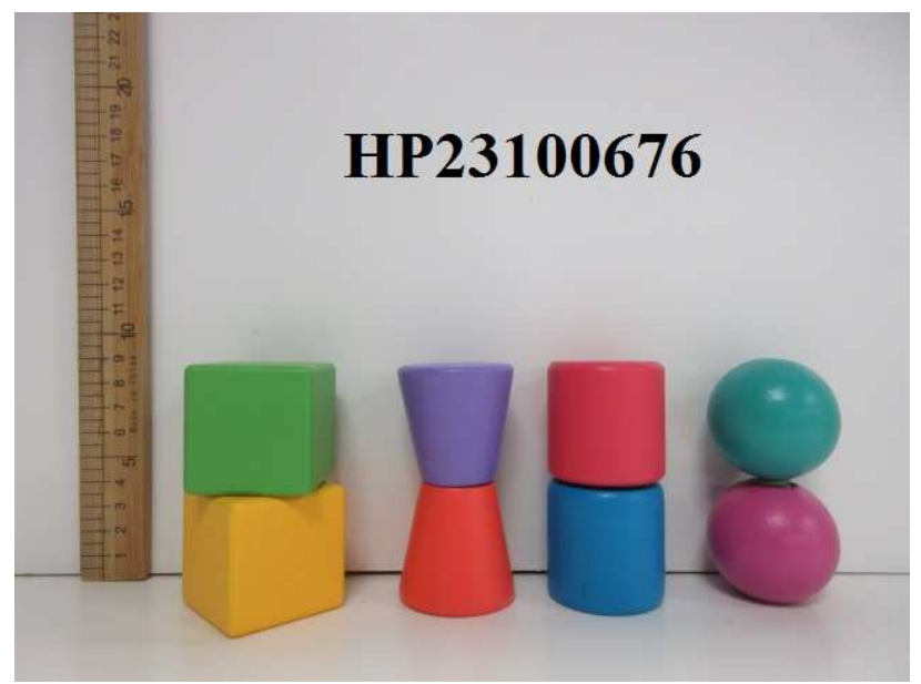
***** End of Test Report *****

Date : 2023-11-03 Page 10 of 10 No. : HP23100676