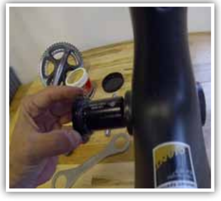
3. Insert drive side cup into frame.