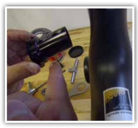
2. Apply a thin layer of high quality grease, PTFE or anti-seize compound to BB cup surface.