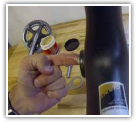
1. Thoroughly clean the bottom bracket shell. Do Not install cups dry. Apply a thin layer of high quality grease, PTFE or anti-seize compound to inside surface of the shell.