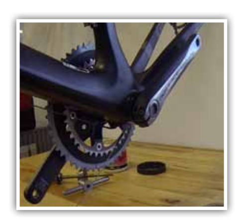
Add spacers as necessary to take up any play, remove spacers as necessary if binding occurs.

NOTE: Due to the wide variety of frame manufacturers, Wheels Manufacturing cannot guarantee compatibility with all frames. Please consult with your specific frame manufacturer before installation. Wheels Manufacturing is not responsible for damage done to your frame as a result of installation or use of this product.