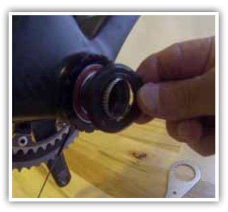
Make sure outer dust seal is in place before installing left crank arm.