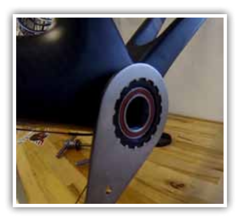
7. Using 16 notch wrench (48.5mm), fully tighten cup. Approximate torque 35-50Nm.