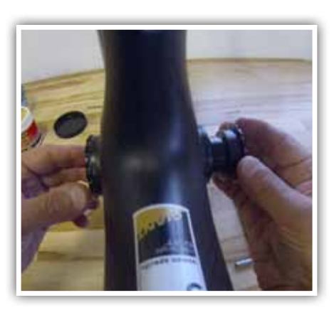
Insert non-drive side cup into frame by hand until threads begin to engage. Pay careful attention to not cross-thread cups.

Apply a thin layer of grease, PTFE or anti-seize compound to non-drive side cup outer surface.