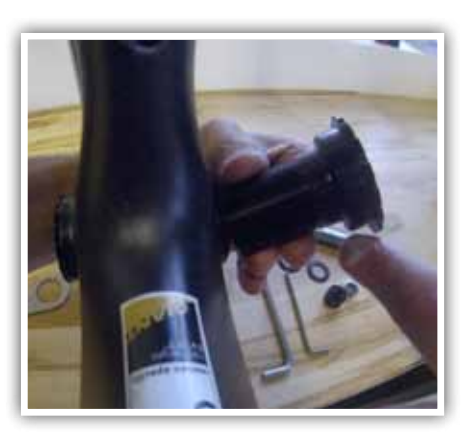
Apply grease to threads. Do not use thread locking compound, PTFE or anti-seize on the threads.

Apply a thin layer of grease, PTFE or anti-seize compound to non-drive side cup outer surface.