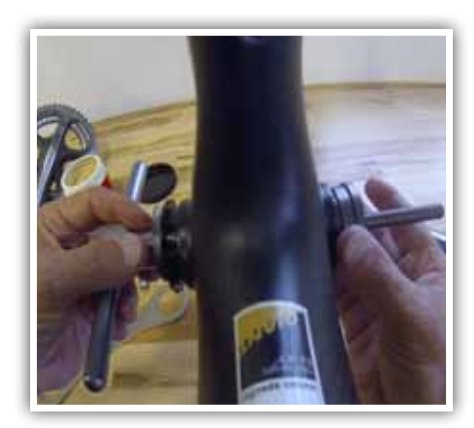
4. Use PRESS-1 or PRESS-4 with one 2437 bearing drift (drive side) and one BB86-OB-24 drift (non-drive side) to press cup into frame. Fully tighten until cup is flush with the frame.