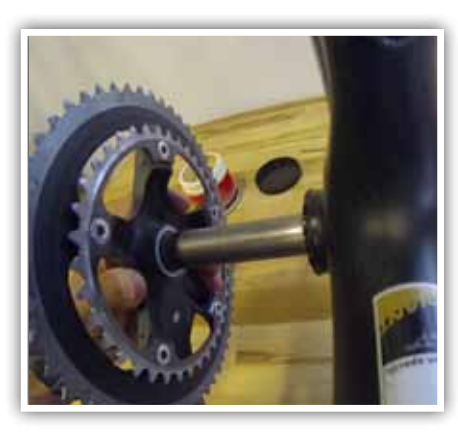
8. Install right crank arm, making sure outer dust seal is installed.