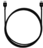
Mini HDMI Cable