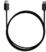
USB-A to USB-C Cable