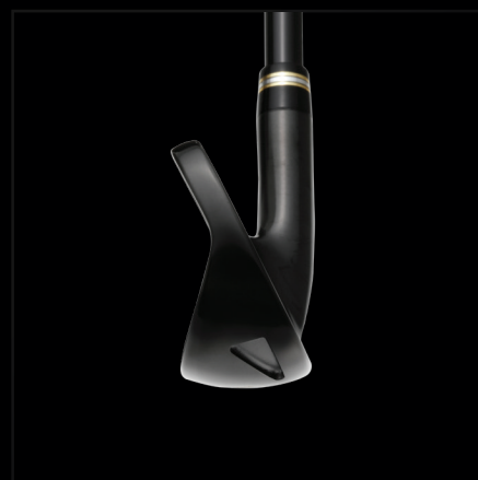
ARMRQ MX BLACK